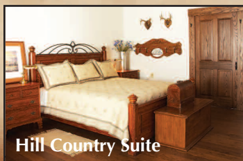
Hill Country Suite