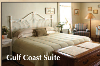
Gulf Coast Suite